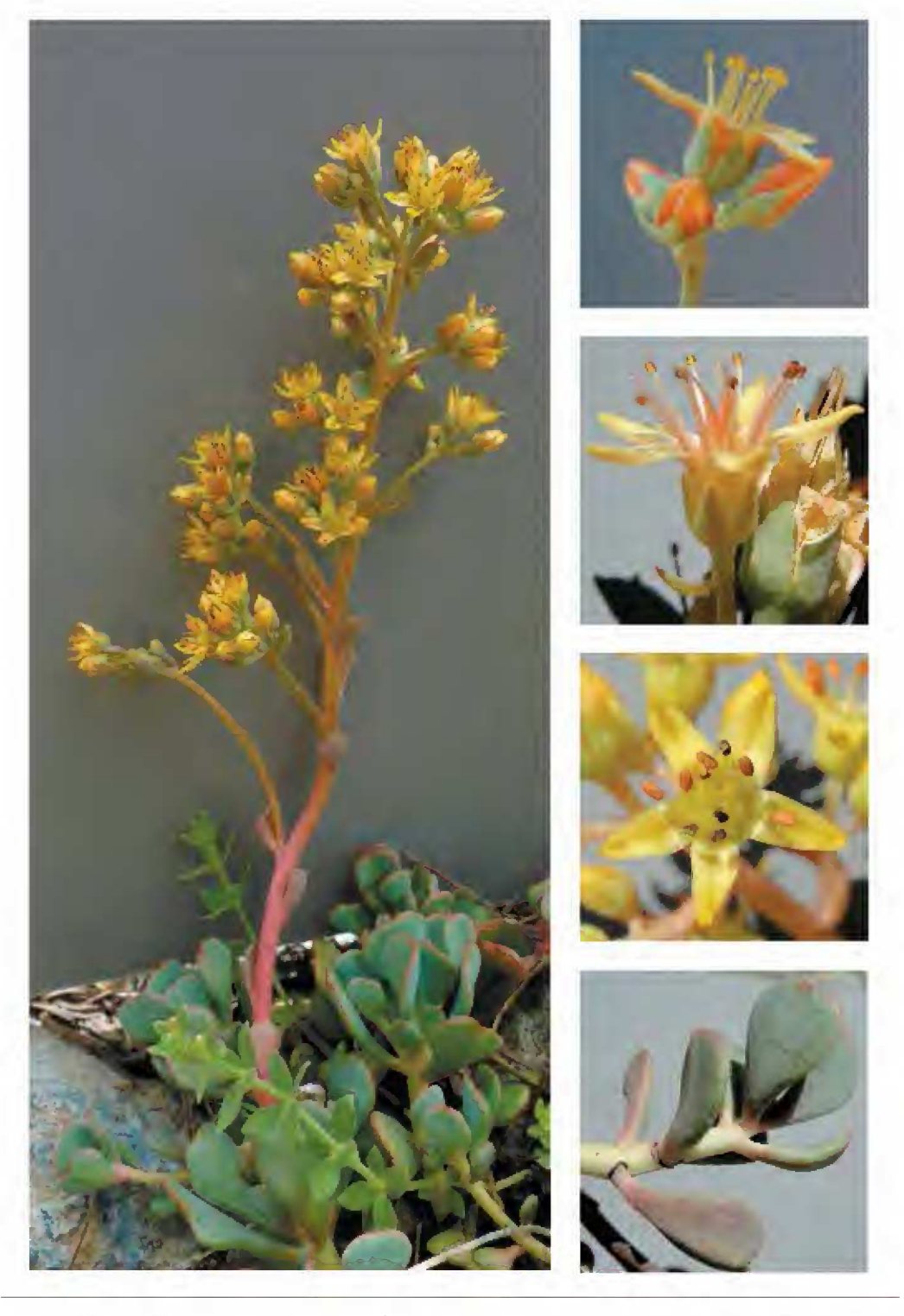
Fig. 2. Sedum kiersteadiae. Note widely spreading yellow petals often marked with red on the dorsal surface, and the open spacing of leaves on the sterile shoot.